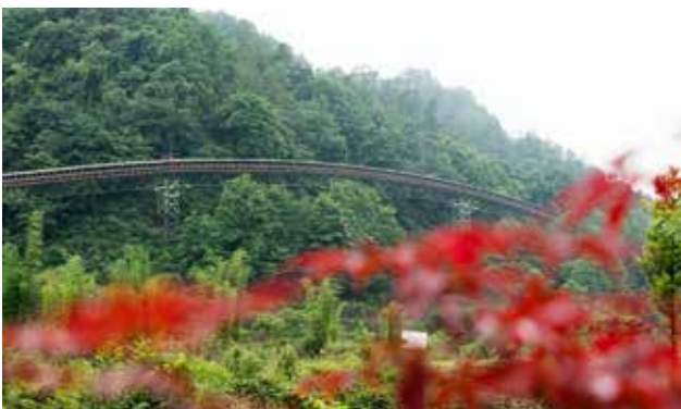
Whenever technically possible, the routing of the conveyor has been adapted to the topography.

Using BEUMER calculation programs, a team of experts precisely calculates the static and dynamic tractive forces of the belt during the development phase of the system. This is the prerequisite for the safe dimensioning of the curves. BEUMER engineers select the type of drive technology and conveyor belts needed on the basis of these calculations. This ensures longevity of the entire system.